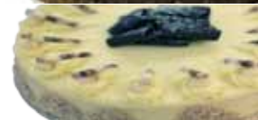
white chocolate + macadamia mud