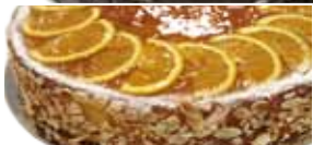
cointreau orange almond [gf/df]