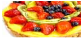
seasonal fruit flan