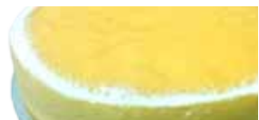
lemon curd baked ricotta cheesecake