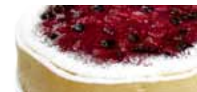
wildberry baked ricotta cheesecake

18-20cm serves 4-6 persons | 26-28cm serves 14-18 persons 18-28cm cakes can be personalised with a greeting of up to 4 words | $7.50