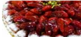
strawberry flan $15 surcharge