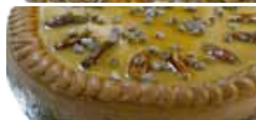
sticky date + chocolate [gf]