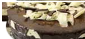
cookies + cream