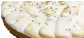
lemon meringue pie