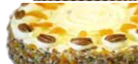
carrot cake [gf]