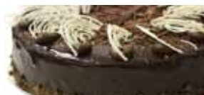
spoon classic mud