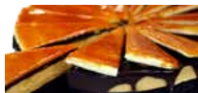
caramel toffee mousse w krokant $5 surcharge