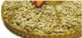
apple crumble pie