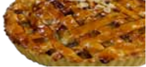
traditional apple pie